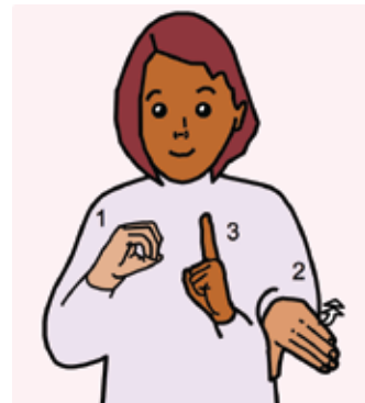
Hit the ball away from your opponent

To see short video clips on the signs and for more squash related BSL signs please view www.ndcs.org.uk/bslforsquash