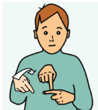
Get back to the T